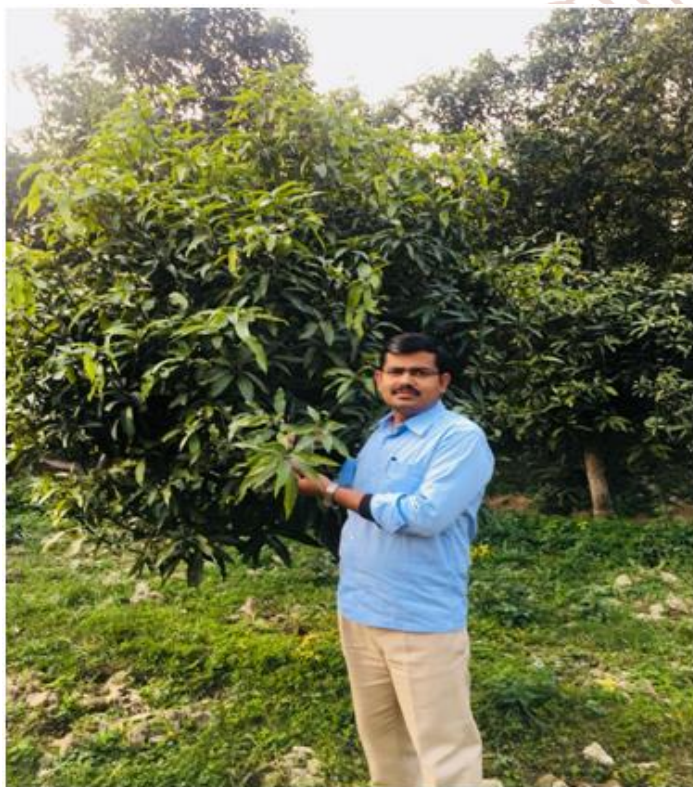
Research scholar with mango tree