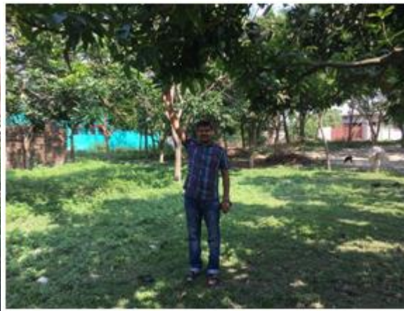
2. Research scholar and mango leaf