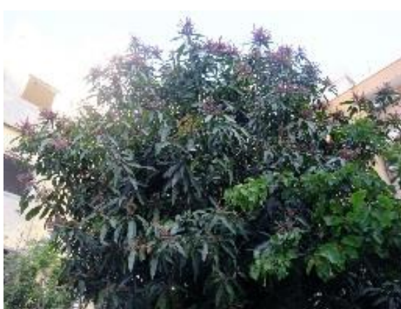
1. Mango leaf cover by cement dust