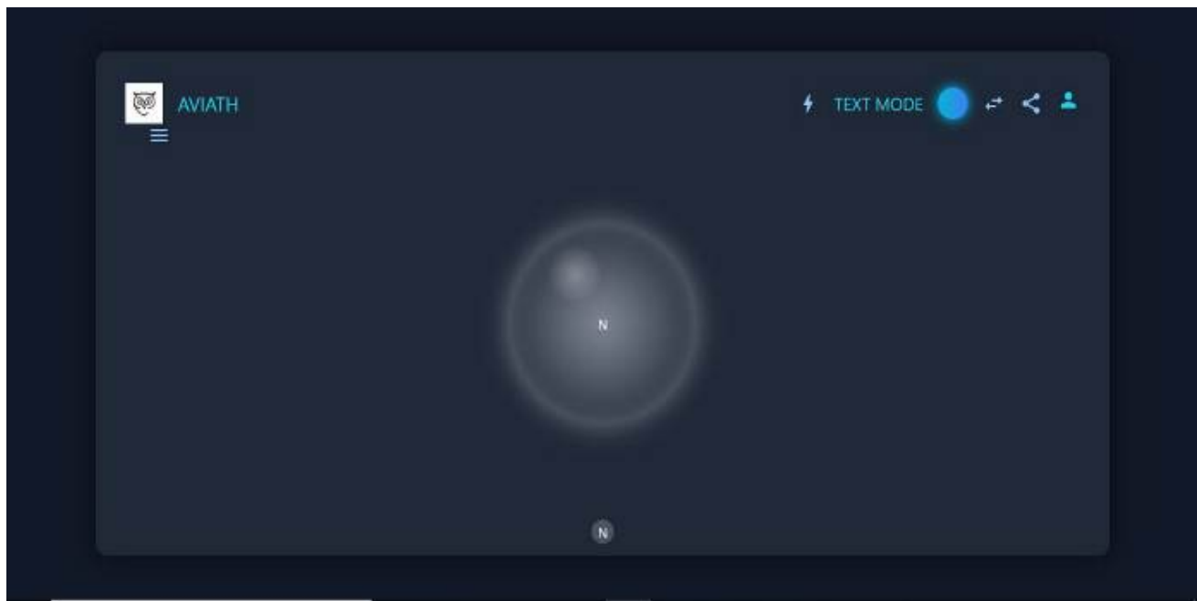
Fig 2. Actual working