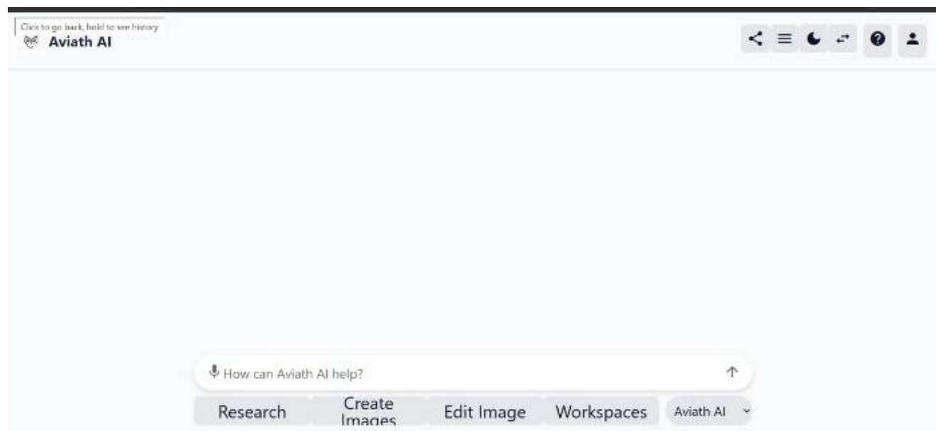
Fig 1. Dashboard

Regarding cross-platform compatibility, Aviath AI was robust on various devices, such as smartphones, desktops, and IoT devices. The system maintained the context of discussions even when users changed devices, with a 95% success rate in holding session data. The process of synchronization was quick, with updates taking place within 2 seconds for the majority of user actions. Such cross-platform performance is a significant plus point since it provides an uninterrupted experience for users who switch devices during the day.