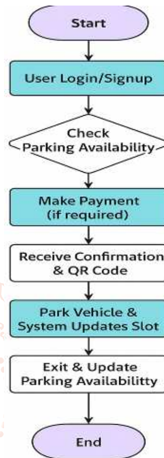
Fig 1. Flowchart

Unit, integration, and user testing, with an emphasis on system stability and response time, are used in the testing phase to guarantee accuracy. After the system is implemented and maintained, it is regularly enhanced depending on user feedback, with plans for future IoT and AI improvements.