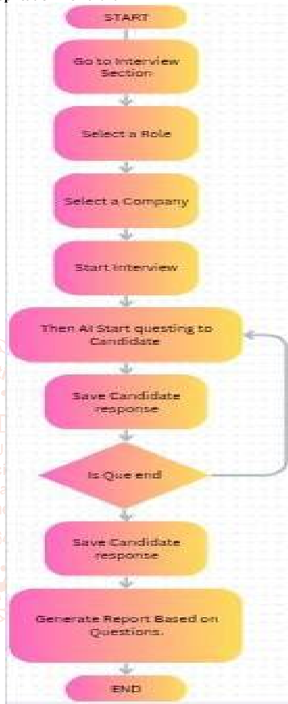
Fig.1. Flow chart

Cost Savings and Efficiency: Virtual interviews offer cost-saving opportunities through reduced overheads and streamlined processes, albeit with a need to maintain assessment quality.