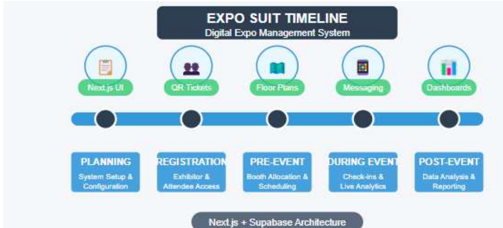
Fig 1.1 : Research Methodology

Findings suggest future enhancements such as AI-driven personalization for exhibitor-attendee matchmaking, blockchain-based ticketing for security, and AR-based virtual experiences to enhance engagement. This structured methodology ensures Expo Suit is a scalable, efficient, and transformative solution for modern expo management [9].