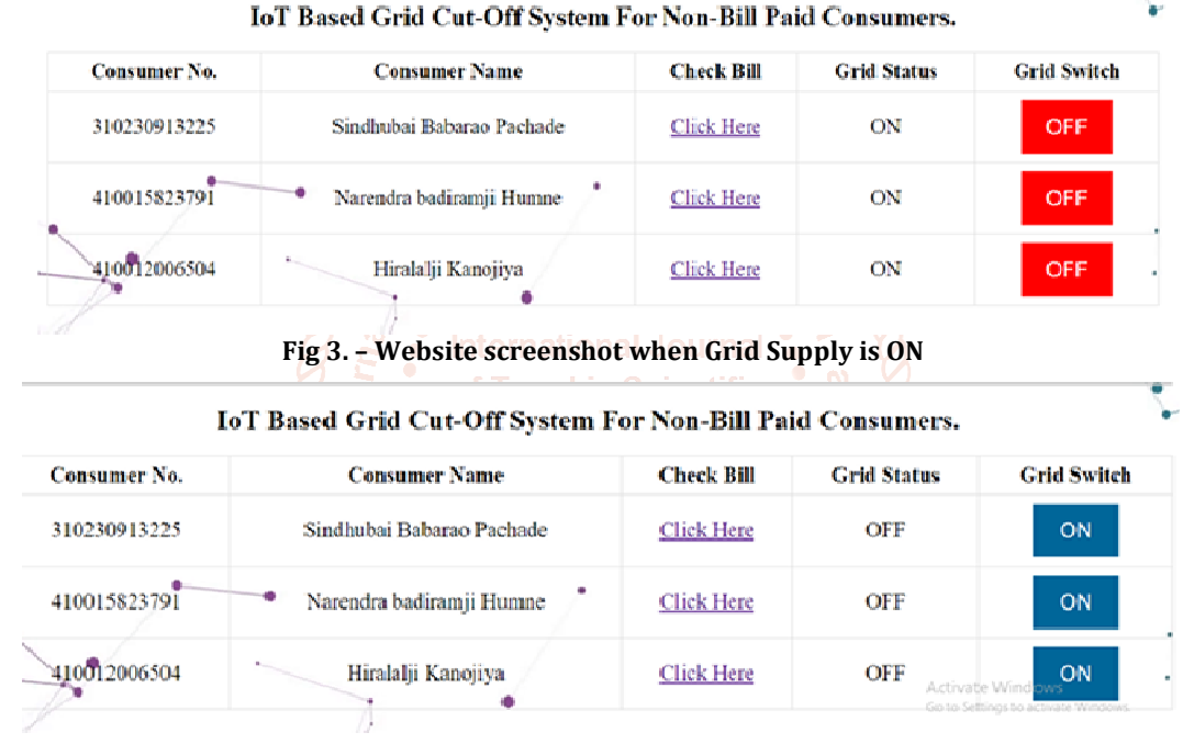
Fig 4. - Website screenshot when Grid Supply is OFF

This project proposed an IoT Based Grid Cut-Off System for Non-Bill Paid Consumer which is helpful to track the energy consumption for the user & Control grid status when he/she not pay electric bill using remote location . This data can be accessed by the user through a web page. So there is no need of human intervention. This system also provides a facility to send SMS to consumer. When they not pay bill and grid supply is cut-off by MSEB user will get an alert notification. This feature helps control the energy consumption. Hence, it reduces the wastage of energy and helps in creating the awareness about energy consumption.