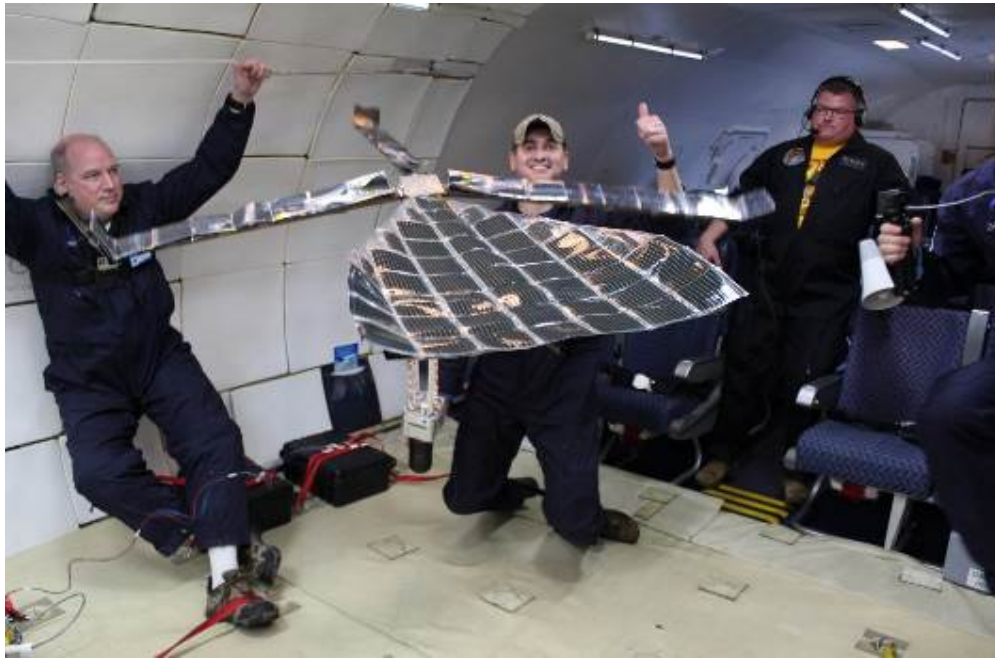
Figure 1 Floating in zero gravity [1].