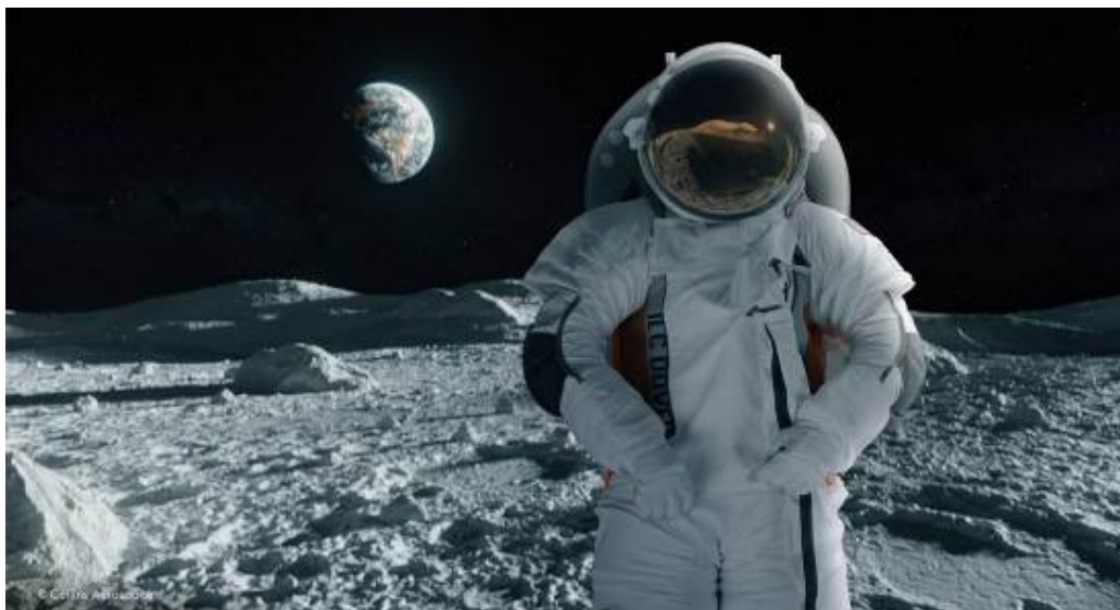
Figure 5 An astronaut with space suit [6].