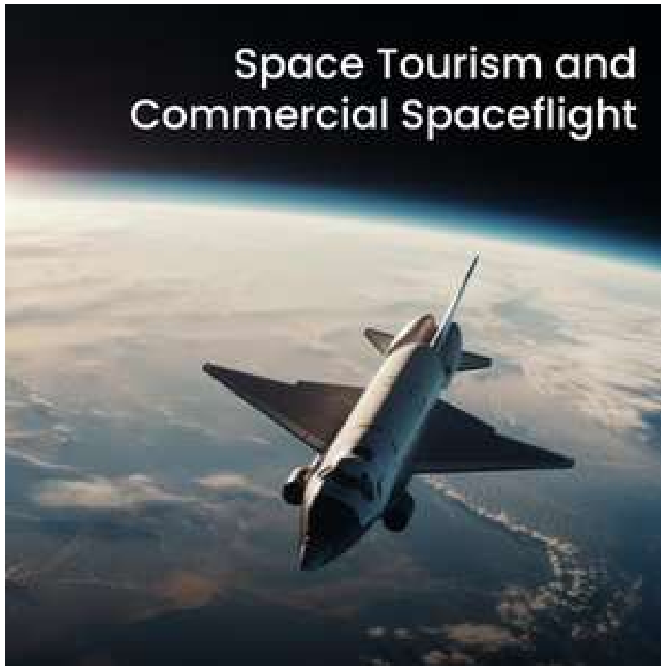
Figure 6 Space tourism [5].