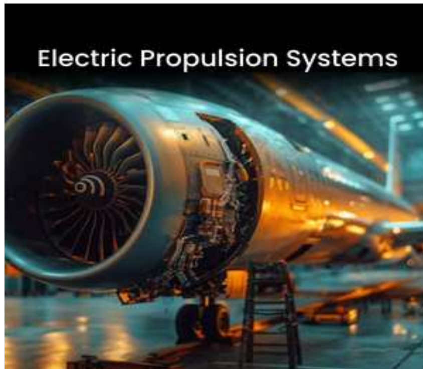
Figure 4 Electric propulsion system [5].