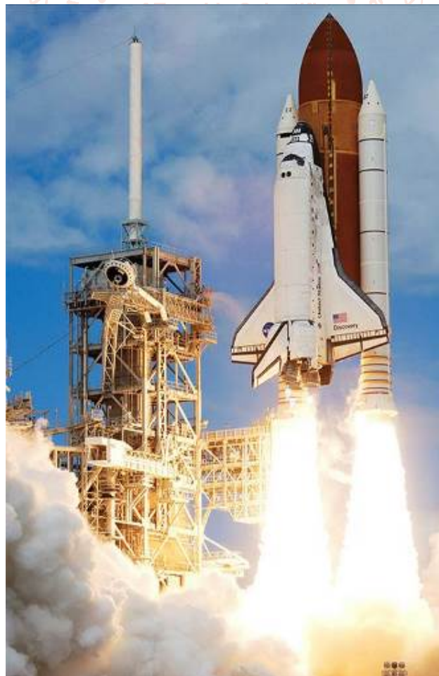
Figure 2 The Space Shuttle [3].