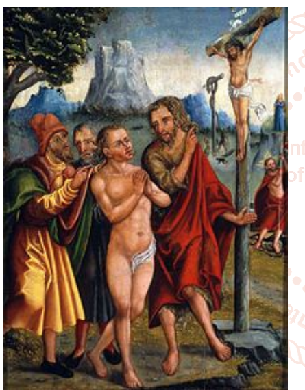
Figure 1 Salvation.