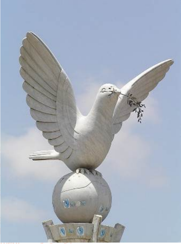
Figure 2 Peace.

Ayx5OlH9kfyofUfrh41ii7MJR49ai3I&sa=X&ved= 2ahUKEwirmMfZsYiJAxWPVqQEHQ-RBFgQtKgLegQIDxAB&biw=1366&bih=580&dp r=1#vhid=0mMSpH96OZCHLM&vssid=mosaic