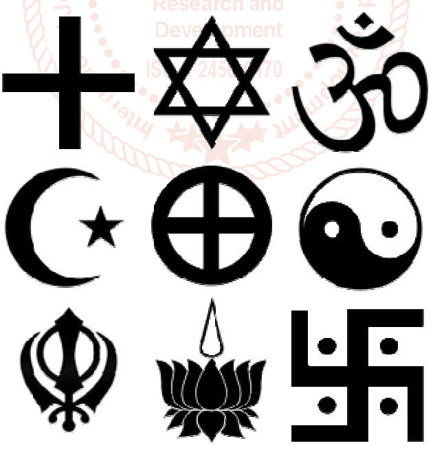
Figure 6. Religion and peacebuilding.

2qeMemLzzt_2BVemHLFNuCSl5jMwuDXSDytcTb5xODqo_tJpGmaSU4pQVEbQQTDWnMPSk8wZNR hz5PGHQwbe9VGOsTvTC6PzQFjR3A55McI87gzvGpjAGq9Nm2Y19Am3ZfXn3nnrjEbsyiaTAyx5OlH9k fyofUfrh41ii7MJR49ai3I&sa=X&ved=2ahUKEwinhZmRtIiJAxWucaQEHewbFiMQtKgLegQIDxAB&cshi d=1728721159646957&biw=1366&bih=580&dpr=1#vhid=jwMttzXW4jN0UM&vssid=mosaic