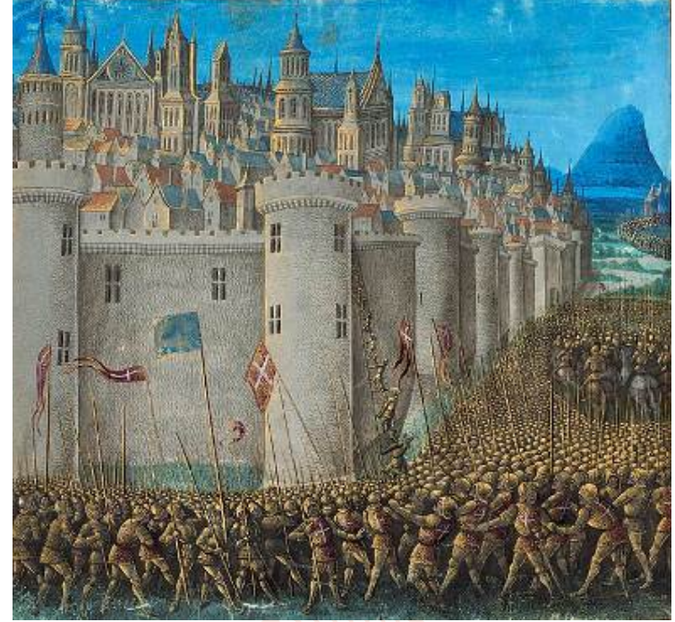
Figure 5. Christianity and violence.

International Journal of Trend in Scientific Research and Development @ www.ijtsrd.com eISSN: 2456-6470