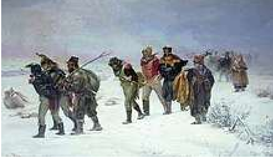
Figure 3 War and peace.