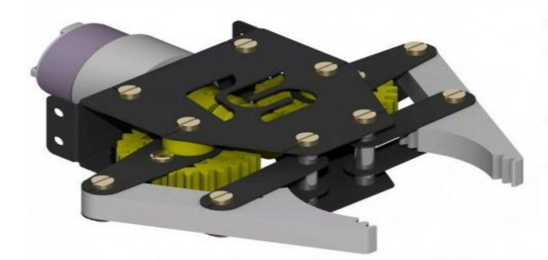
Figure 2: Gripper of Robotic arm