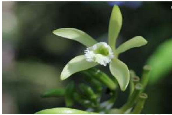
Fig1: Vanilla plantifolia