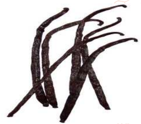
FlowerFig2: Dried vanilla seed pods

Vanilla is the second most expensive price next to saffron with an compound "vanillin" and is used as pleasant, aromatic and aphrodisiac purposes. Vanilla aromatic is a homoeopathic medicine <sup>(2)</sup>.