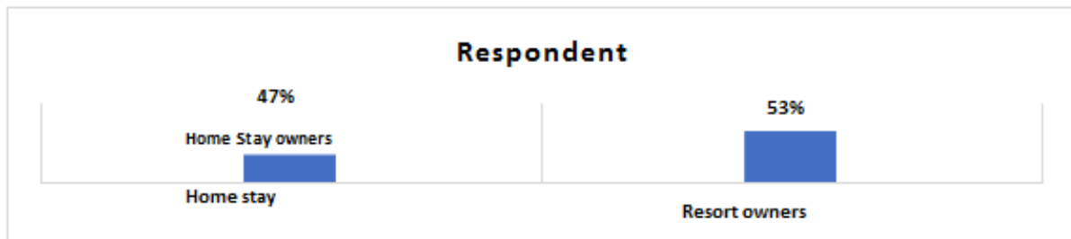
Figure no 1.0

The above table 1. and figure 1 depicts that 47% Home stay owners and 53% are Resort Owners participated in the survey conducted.