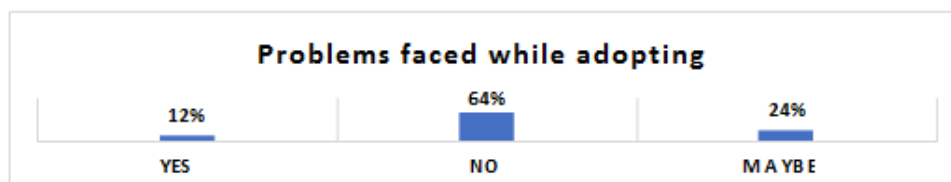
Figure no: 3