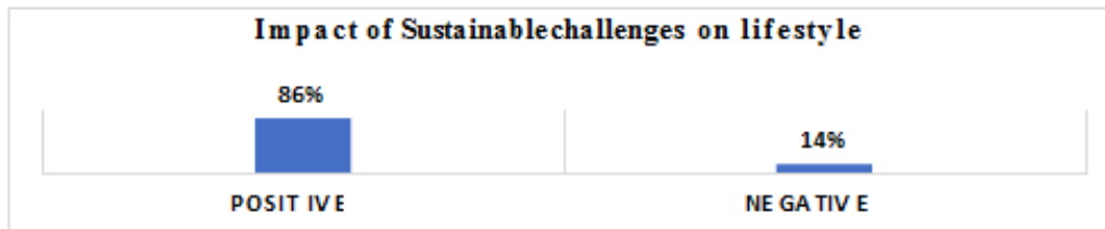
Figure no: 2

The above table 2 and figure 2 depicts the impact of disruptive technology on lifestyle transformation of Resorts and Home stay owners. 86% of them consider there is positive lifestyle transformation and 14% as consider there is negative lifestyle transformation.