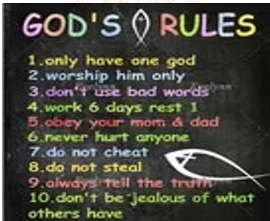
Figure 1 The commandments explained in simple terms [2].