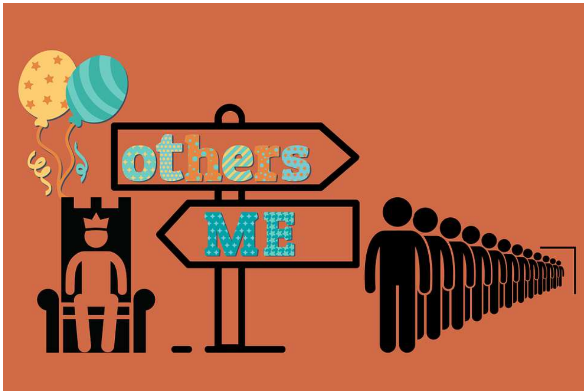
Figure 2 A typical demonstration of selfishness [4].