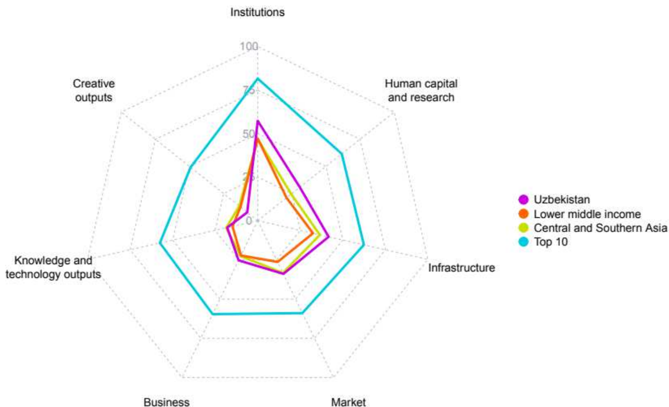
Figure 3 The seven GII pillar scores for Uzbekistan

Over the past 15 years, the population of Uzbekistan has increased from 27 million to 35 million, and the land area per person has decreased from 23 to 16 hectares. Water resources intended for irrigating 1 hectare of land decreased from 3048 m 3 to 2889 m 3 . The solution to this problem is the transition to farming based on innovative digital technologies. In this case, digital agriculture, which is the main solution for effective use of limited land and water resources in agriculture, is of great importance.