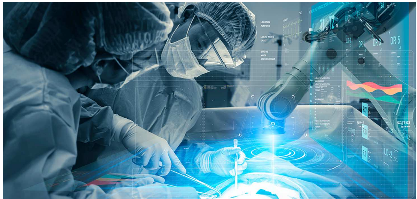
Figure 3 A typical example of robotic surgery [12].