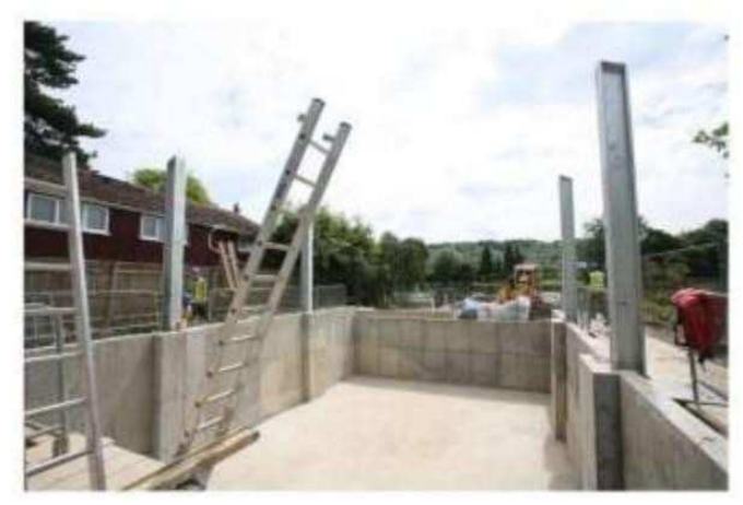
Fig - 5: Construction of amphibious house

The above Fig - 4 and Fig - 5 indicate the construction in process of the Amphibious House.