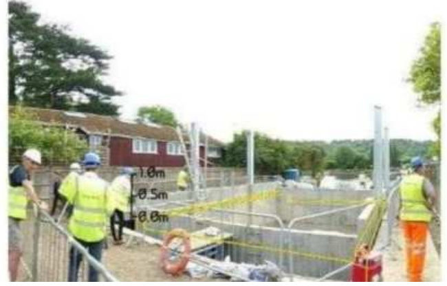
Fig - 4: Construction of amphibious house