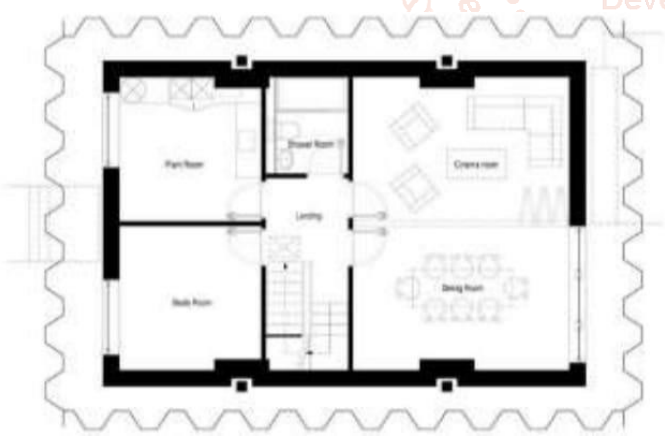
Fig - 3: Plan of the amphibious house

In the Fig -2 above, The Cut away construction Section of the amphibious house describes the components which are, Roof light, Gulley and guidepost, Zinc rainskin cladding, Junction of foundation with guidepost, Wet clock access way, Foundation and guideposts and Timber with steel frames.