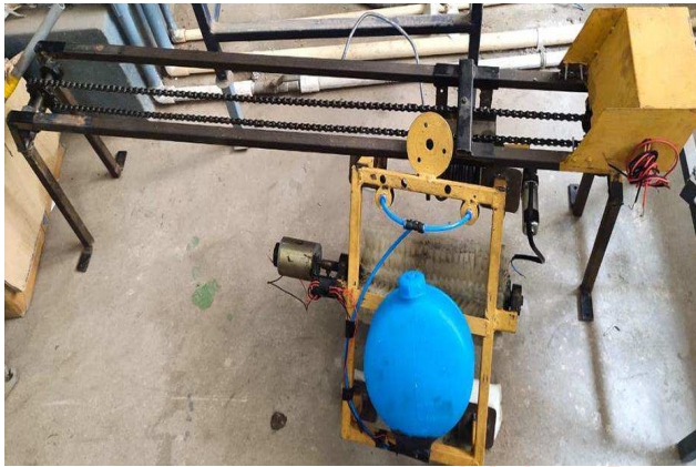
FIGURE 3 Final prototype

This project is involved cleaning the glasses with the help of a roller brush and microcontroller. The Semi-automatic glass cleaning machine is explained in the last chapter. The time study and cost estimation involved in the project are explained in this chapter.