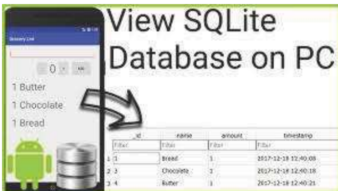
DATA RETEIVAL MODULE