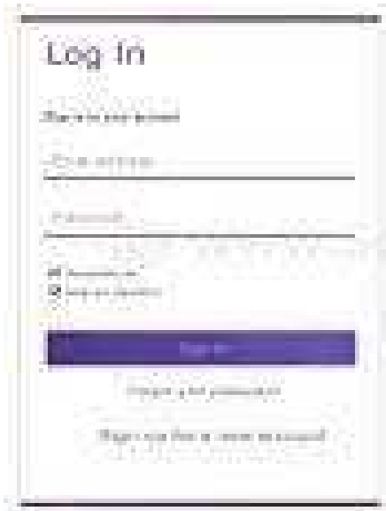
DATA ENTRY MODULE