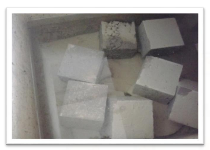
Fig.1 Cubes immersed in H<sub>2</sub>SO<sub>4</sub>