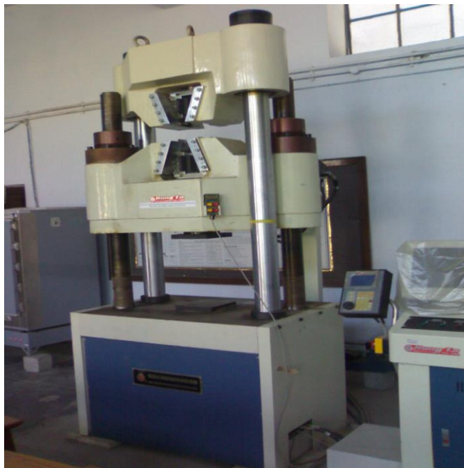
Plate . Compression testing machine (ACTM)

Compressive strength of control and plastic added concrete