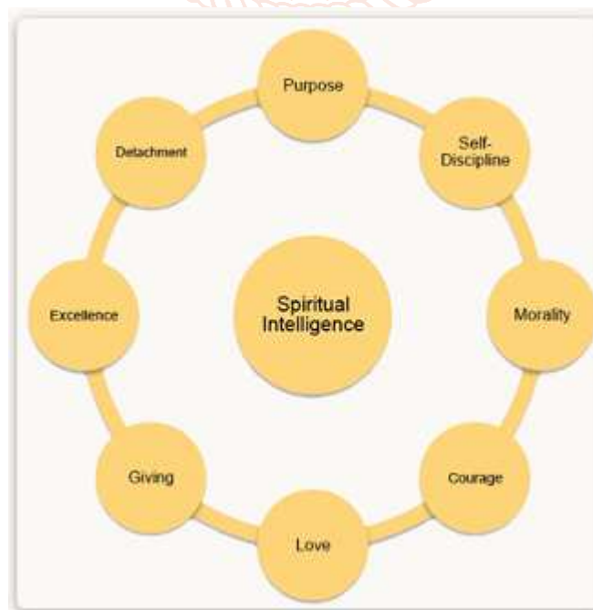
Figure 3 Spiritual intelligence in leadership [7].