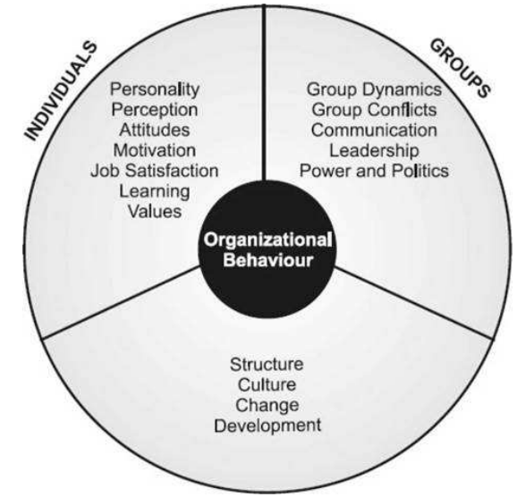
Figure 1: Organizational behavior structures for Individuals and Groups