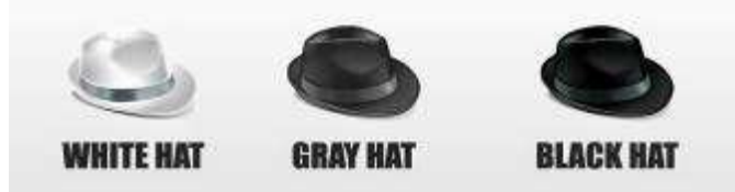
Types of Hackers

The hackers square measure categorized styles of Hackers