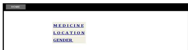
Fig2: Classified Dataset based On Subject