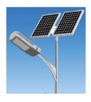
Solar Powered LED Street Light with Auto Intensity Control