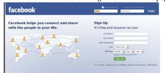
Figure 1.Original Facebook Web page

The logo, Templates of the web page is make the user to believe. The Internet growing day by day which lead the many fake website that make the user mislead. The Figure 1 and 2 show the difference of the original and fake Web page.