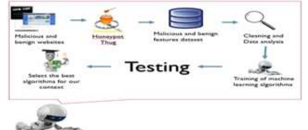
Figure 3: The Flow Diagram of the Phishing Detection

These are the some of the classification algorithms in which the practical Implementation can be performed in order to check the accuracy of the detection phishing.