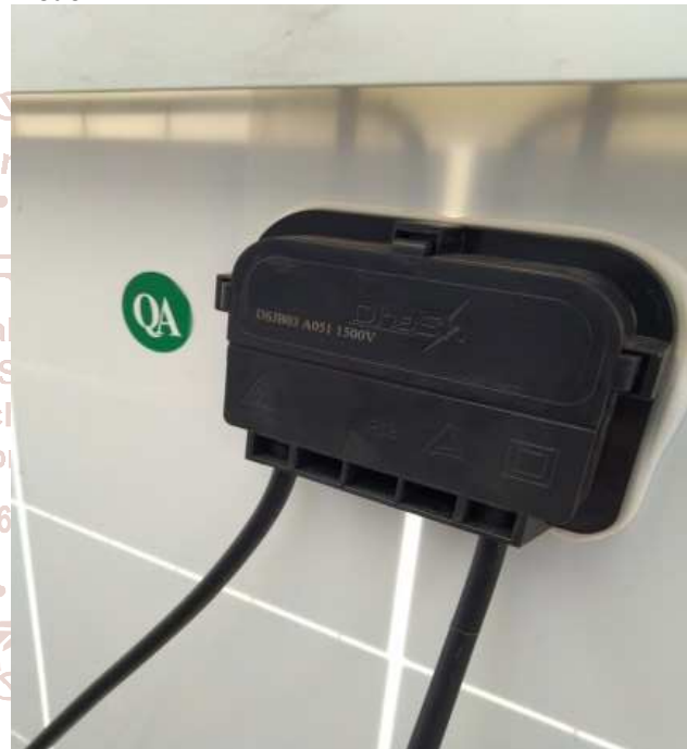
Figure 8: - Diode

This is usually installed on every panel on the back side in order to prevent the reverse flow of current. Bypass Diodes are used in parallel with either a single or a number of photovoltaic solar cells to prevent the current(s) flowing from good, well-exposed to sunlight solar cells overheating and burning out weaker or partially shaded solar cells by providing a current path around the bad cell. Blocking diodes are used differently than bypass diodes.