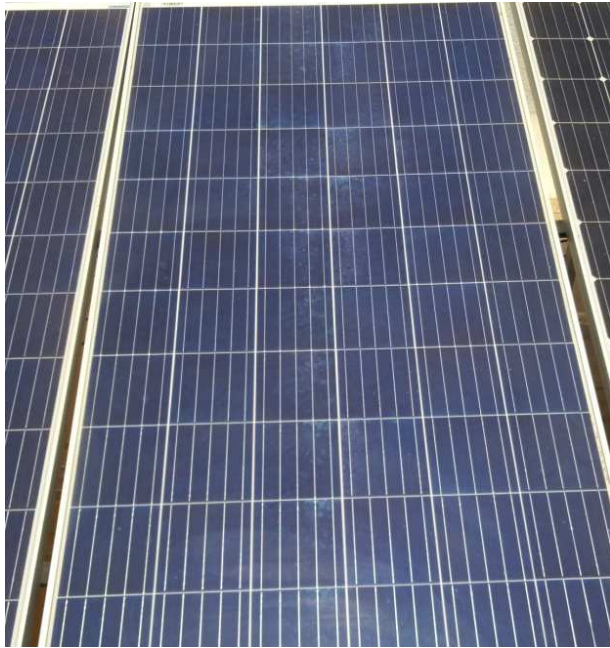
Figure 4: - Poly Crystalline Solar Panel

The polycrystalline solar cells are also known as poly silicon and multi-silicon cells. They were the first solar cells to be developed when the industry started in the 1980s. Most interestingly, polycrystalline cells do not undergo the same cutting process as the mono crystalline cells. Instead, the silicon is melted and then poured into a square mould. This is what creates the specific shape of the polycrystalline.