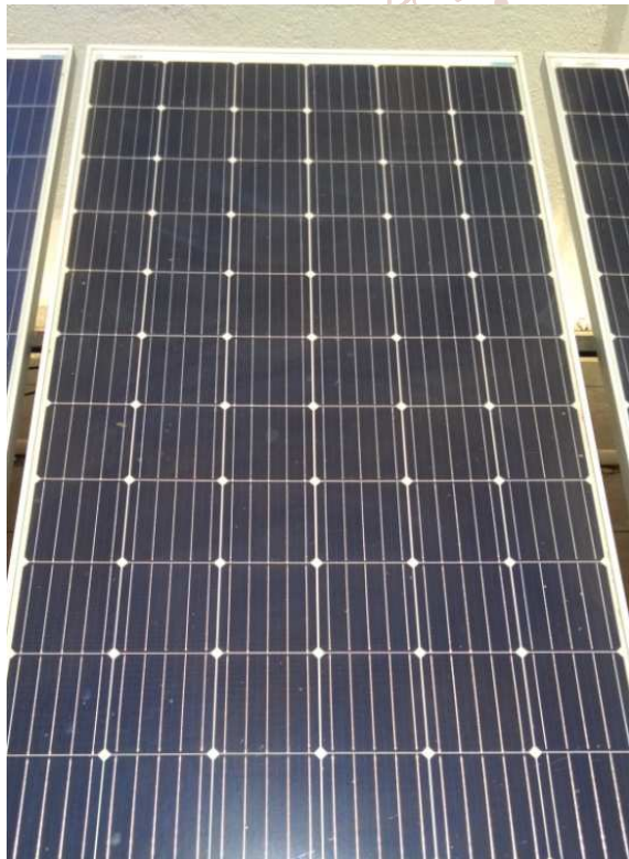
Figure 3:- Mono Crystalline Solar Panel

The mono crystalline solar cells are also known as single crystalline cells. They are incredibly easy to identify because they are a dark black in colour.