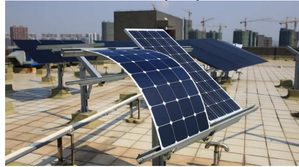
Figure 5: - thin-film solar cells

If you are looking for a less expensive option, you might want to look into thin-film. Thin-film solar panels are manufactured by placing one or more films of photovoltaic material (such as silicon, cadmium or copper) onto a substrate. These types of solar panels are the easiest to produce and economies of scale make them cheaper than the alternatives due to less material being needed for its production.