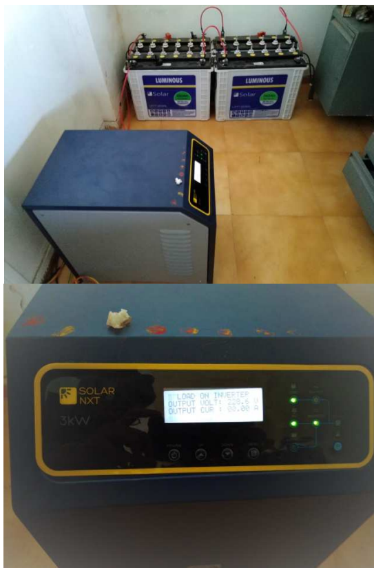
Figure 7: - Inverter and Batteries