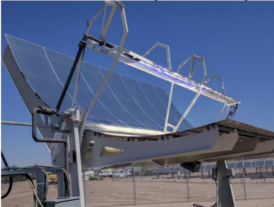
Figure 6: - Concentrated PV cells

Concentrated PV cells generate electrical energy just as conventional photovoltaic systems do. Those multi-junction types of solar panels have an efficiency rate up to 41%, which, among all photovoltaic systems, is the highest so far.