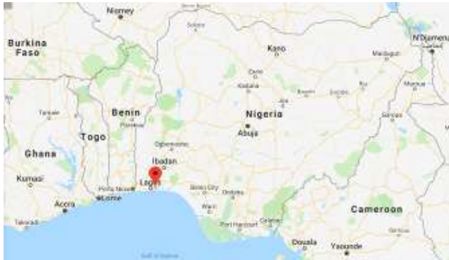
Figure1. Map showing the study area.

The study area is situated in Lagos, Nigeria with latitude 6.465422°N and longitude 3.406448°E with the gps coordinates of 6° 27' 55.5192" N and 3° 24' 23.2128" E shown in Figure 1. Static Pile load tests were carried out on five locations within the study area. The locations include Lekki Phase 1, Ikorodu, Lekki, Aja and Onikan as shown in Figure 2.