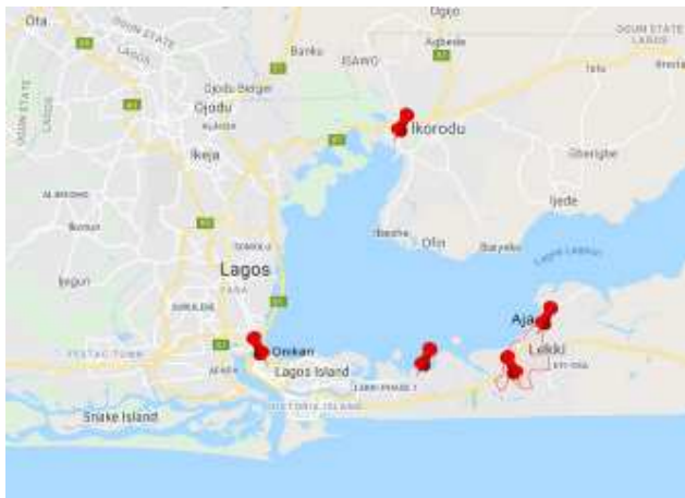
Figure 2: Map showing the locations of the static pile load test within the study area.