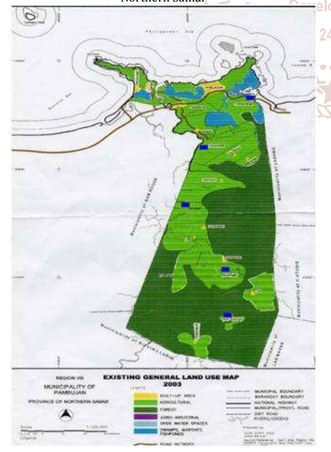
Figure 1. Map of the Municipality of Pambujan, Research Northern Samar

Generally, this research, done in 5 selected barangays of Pambujan, Northern Samar, aimed to document the avian fauna in different habitat types in the municipality, with a view of providing baseline information useful in the formulation of necessary management interventions in the protection and conservation of birds in the study area. Specifically, it intended to: 1) identify the avian species existing in the area; 2) determine its relative frequency; 3) describe its distribution in the area; 4) ascertain the conservation status of the birds identified; and, 5) enumerate anthropogenic activities affecting the existence of birds in the study area. The achievement of the study objectives was limited by the availability of equipment, particularly a camera equipped with telephoto lenses, and the ability of the researcher to spend longer observation hours for security reasons.