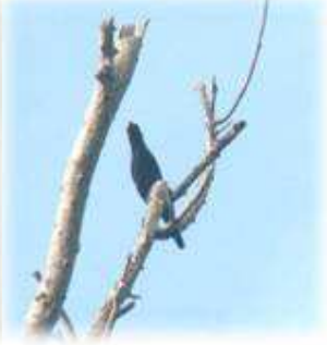
Asian Glossy Starling