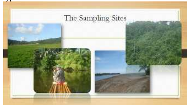
Research Design and Sampling Technique

This study was conducted in Barangay Canjumadal, Barangay Don Pedro de la Cruz, Barangay Ginulgan, Barangay Senonogan, and Barangay Don Sixto Balanquit, Pambujan, Northern Samar, representing different habitat