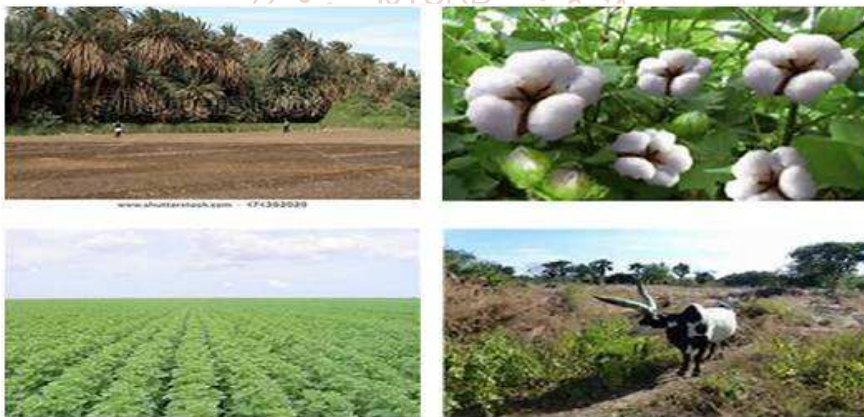
Figure 2: Aspects of Agriculture in Sudan

Agriculture and livestock (Figure 2) are among the most important sources of livelihood in Sudan for many of the country's population. Sudan is one of the largest countries on the African continent in terms of area and one of the most important countries in the world where water and arable land are available, making it a confirmed global food basket.