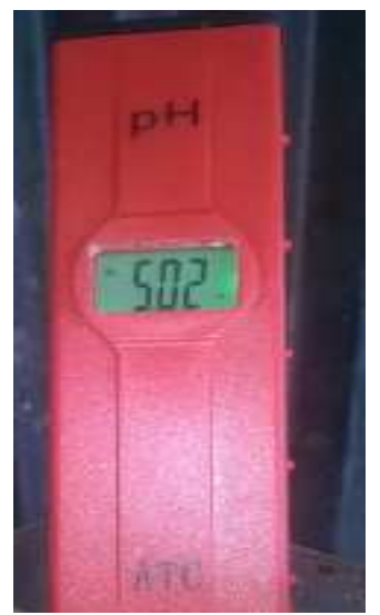
Figure 4: pH Meter