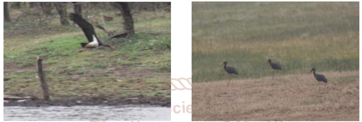
Fig.9a. Black stork around pond in shivpuri Fig.9b: Black stork around the reservoir in Lalitpur

The Black storks were seen along the reservoirs and ponds (Fig.9a & b). They were not reported from rivers, agricultural fields and open fields in the study area. These birds are known to feed at ponds and outfalls their use of rivers is unheard of [10]. The preferred habitats by migratory Black stork are often affected by the unpredictable rainfalls in Bundelkhand Region. The droughts result in complete drying of the ponds. In the case of migrating birds, loss of habitat in wintering areas has unconstructive effects on their reproductive success and plays a key function in the turn down of their populations [17, 18].