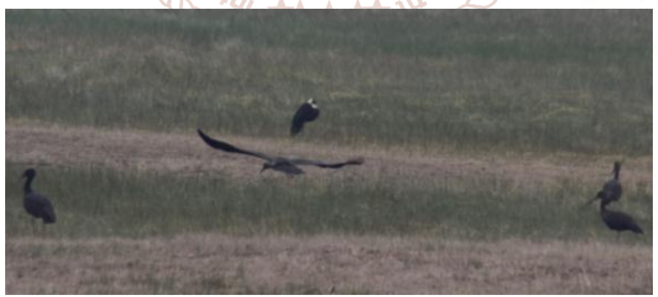
Fig.4: Flock of Black Stork with the Woolly-necked Stork