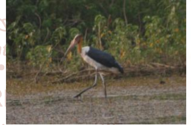
Fig.2 d:Lesser Adjutant (Leptoptilos javanicus)

Fig.2 b:Woolly-necked stork (Ciconia episcopus)