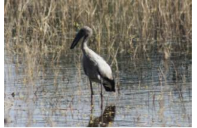
Fig.2a:Asian openbill (Anastomus oscitans)