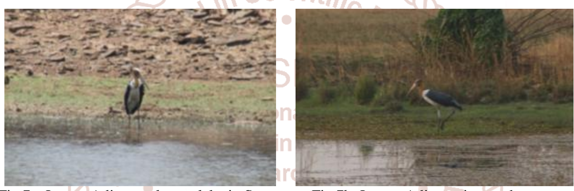
Fig.7a: Lesser Adjutant along a lake in Sagar Fig.7b: Lesser Adjutant in marshy area

The Lesser Adjutants were seen near natural lakes in protected and unprotected areas. They were also seen in small marshes near the rivers (Fig.7a & b). The Lesser adjutant is habitually reported in mangrove, mudflats, coastal swamps and marshes, flooded grassland [13] although it has also been found in shallow puddles and drying ponds with plentiful fishes together with mudskippers [14]. These wetland-dependent birds occupy the riverbeds, floodplains, paddy fields, swamps, lakes and forest pools [15].