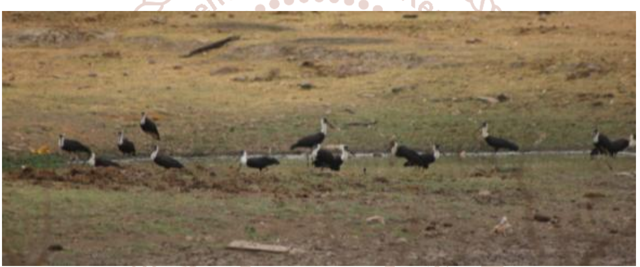
Fig.3: Flock of Woolly-necked Stork in Deogarh, Lalitpur

AOB-Asian open bill; WNS-Woolly-necked stork; BNS-Black-necked stork; LA-Lesser Adjutant; PS-Painted stork; BS-Black stork