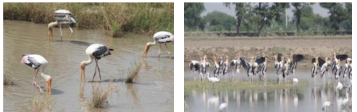
Fig.8a & b: Painted storks foraging in open fields filled with rain water

The Painted storks were seen foraging in all five types of habitats studied. They preferred open fields (water filled due to rains or seep out from canals) for foraging (Fig.8a & b). The Painted stork showed negative correlation of water level with success rate and steps i.e. the success rate decreased with increase in water level. There was no competition among the three species of storks (Black-necked stork, Asian-open bill and Painted stork) due to complete separation of their niches and different levels of water depth [9]. They also shared their foraging sites with Sarus cranes, egrets and herons. Foraging in groups is advantageous for the reason that it lessens the threat of predation and, consequently, reduces the expenditure of time and energy on vigilance [16]. Although the surveys were carried out mostly during the morning times, the storks were seen in flocks during the noon also. It was observed that they spent long time in fields that included the foraging (during morning) and resting (during noon). Consistent with Gibbs, smaller species spend a longer time foraging as compared to larger bird species. Large birds exhibit normal afternoon rest periods unlike the small species.