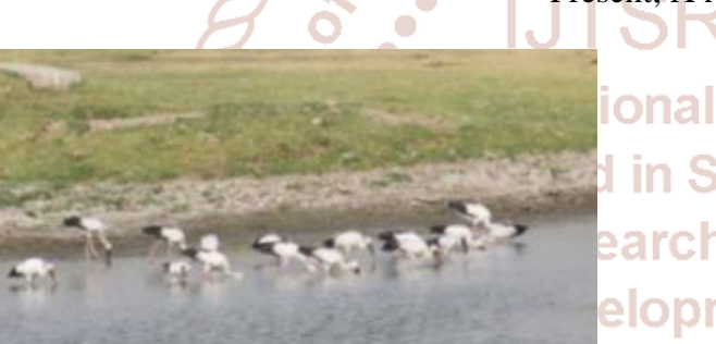
Fig.5a:Flock of Asian-Open bill at Pahuj Reservoir