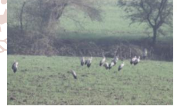
Fig.5c: Flock of Asian-Open bill along a pond in Jhansi Fig.5d:Flock of Asian-Open bill in agricultural field

Fig.5b:Flock of Asian-Open bill along river Betwa