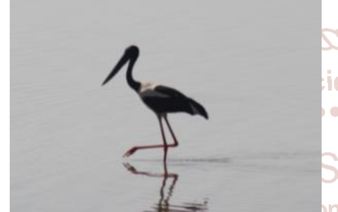
Fig.2c:Black-necked stork ( Ephippiorhynchus asiaticus )