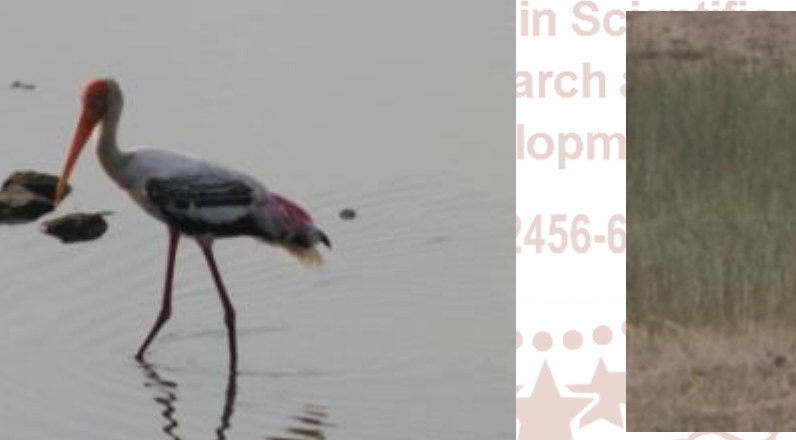
Fig.2e: Painted stork (Mycteria leucocephala)Fig.21f: Black Stork (Ciconia nigra)Fig. 1a-f: Stork Species reported in the study area

Five species of storks (Asian open bill, Woolly necked stork, Black-necked stork, Lesser adjutant and Painted stork) occurred in all the six districts. Black stork, the migratory species was not recorded from Tikamgarh, Jalaun and Jhansi (Table 2). The storks were observed in solitude, in pairs, in flocks and in mixed flocks. The Asian Open-bill ( Anastomus oscitans ) was mostly observed in flocks that ranged from 6 to 500±. Woolly-necked Stork, also known as White-necked stork was mostly seen in pairs or in small flocks of 4-8 storks. On certain occasions they were seen in flocks ranging from 30-40 (Fig.3). This