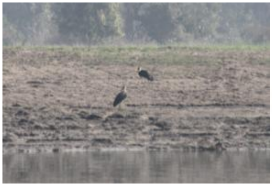
Fig.6a:Woolly-necked stork in agricultural field Fig.6b:Woolly-necked stork along river bank

The Lesser Adjutants were seen near natural lakes in protected and unprotected areas. They were also seen in small marshes near the rivers (Fig.7a & b). The Lesser adjutant is habitually reported in mangrove, mudflats, coastal swamps and marshes, flooded grassland [13] although it has also been found in shallow puddles and drying ponds with plentiful fishes together with mudskippers [14]. These wetland-dependent birds occupy the riverbeds, floodplains, paddy fields, swamps, lakes and forest pools [15].