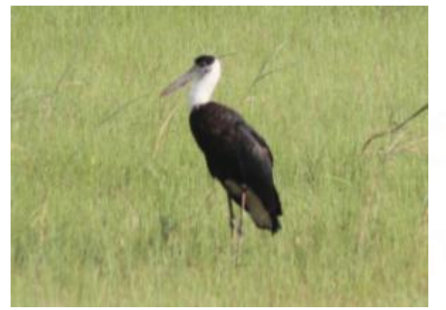
Fig.2 b:Woolly-necked stork (Ciconia episcopus)