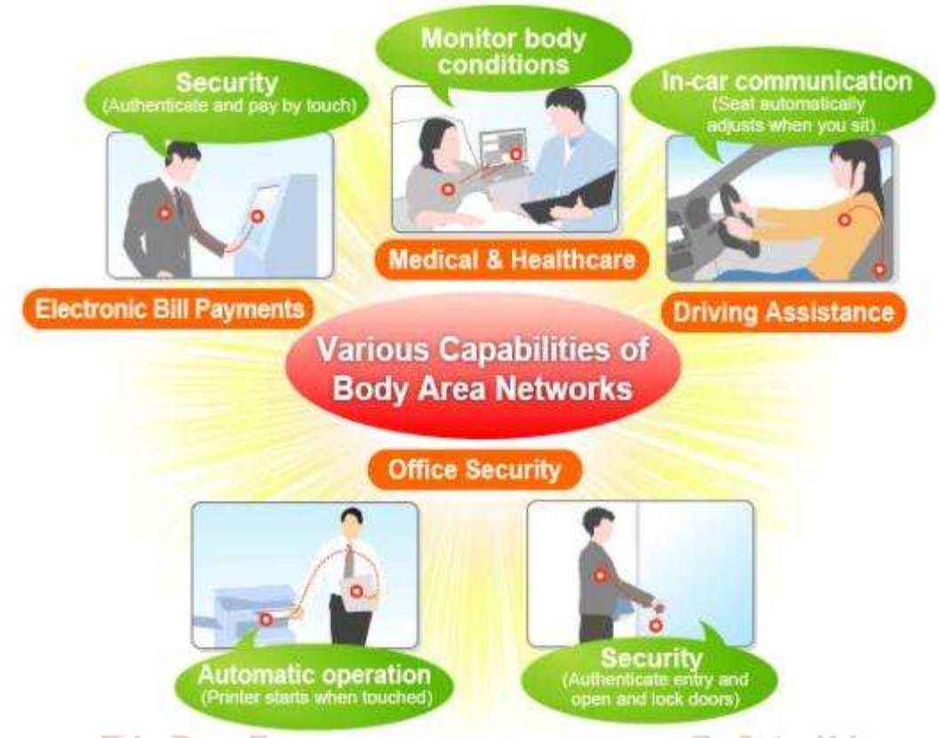
Figure 2: Application of WBANs