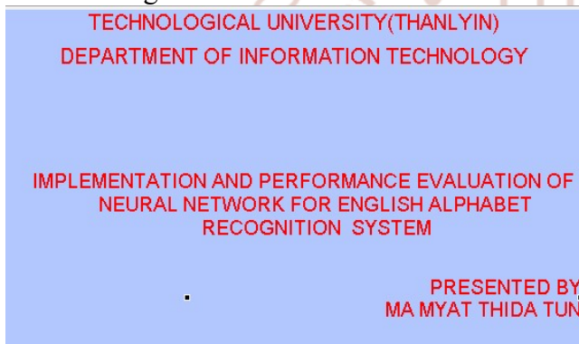
Fig. 2 Cover window

>> Main-Program At this time, cover window appears as shown in Figure 2.