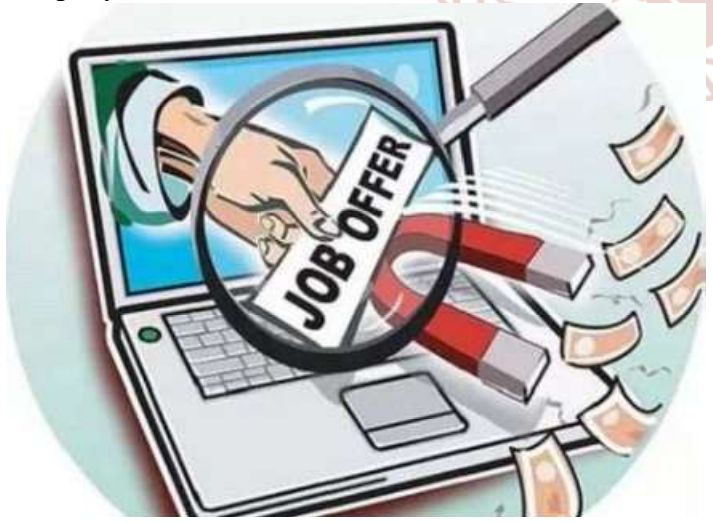
Fig. 3 Wiring money before getting hired

If in case, they demand to pay then for sure the company is fake.