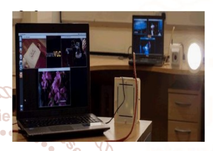
Fig: Demonstration of Lifi.

pretty fast rate so the LED which is blinking 1 and 0 continuously and sending information to the user. On the receiver's end there is a photo detector which can understand that light pattern and converts the data.