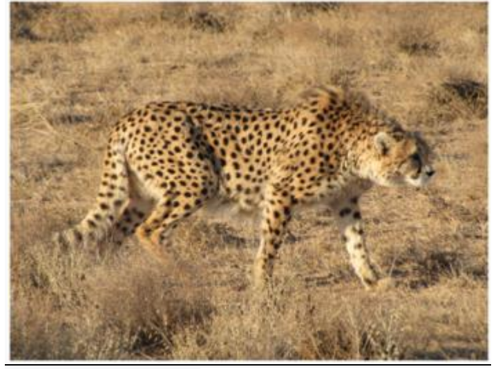
KINGDOM:Animalia PHYLUM:Chordata CLASS: Mammalia ORDER: Carnivora FAMILY: Felidae GENUS:Acinonyx

Became extinct: Approximately 60 years ago in India.