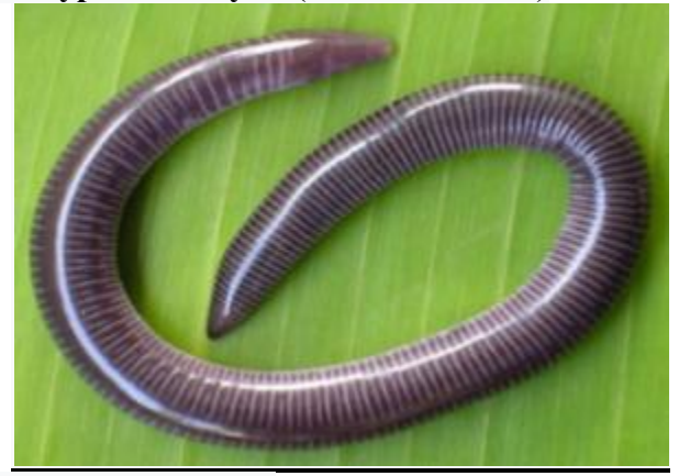
KINGDOM: Animalia PHYLUM: Chordata CLASS: Amphibia ORDER:Gymnophiona FAMILY:Ichthyophiidae GENUS:Uraeotyphlus Became extinct:Approximately 5 years before

The Indian Caecilian, genus name Uraeotyphlus, is doubly unfortunate: not only have various species gone extinct, but most people are only dimly aware (if at all) of the existence of caecilians in general. Often confused with worms and snakes, caecilians are limbless amphibians that spend most of their lives underground, making a detailed census--much less an identification of endangered species--a huge challenge. Surviving Indian Caecilians, which may yet meet the fate of their extinct relatives, are restricted to the Western Ghats of the Indian state of Kerala which are currently not spotted the past five years