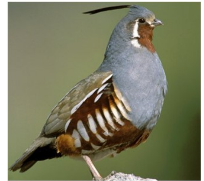
KINGDOM: Animalia PHYLUM: Chordata CLASS: Aves ORDER:Galliformes FAMILY:Phasianidae GENUS: Ophrysia Became extinct:Allegedly in 1876

A medium-sized quail belonging to the pheasant family, the Himalayan Quail has not been spotted in over 150 years. It lived mostly in what is today's Uttrakhand. Although it hasn't been formally declared extinct, it is widely feared to be. Though it would be nice to hope that they found a way to avoid detection by the greediest species on the planet. Himalayan quails have a long tail covert and the 10 feathered tail