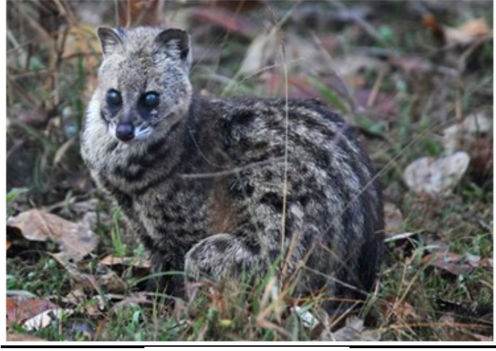
KINGDOM: Animalia PHYLUM: Chordata CLASS: Mammalia ORDER: Carnivora

FAMILY: viverridae GENUS: Viverra Became extinct:Approximately in 1987