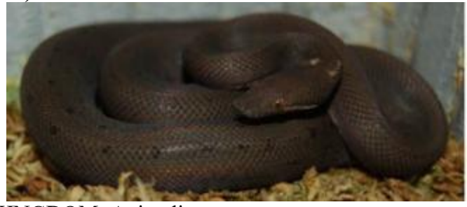
KINGDOM: Animalia PHYLUM: Chordata CLASS: Reptilia ORDER: Squamata FAMILY:Bolyeriidae

Bolyeriamultocarinata(Round island burrowing boa)