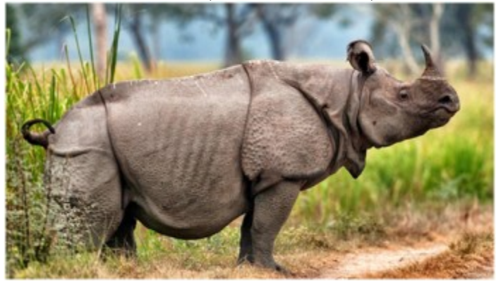
KINGDOM: Animalia PHYLUM: Chordata CLASS: Mammalia ORDER: Perissodactyla FAMILY: Rhinocerotidae GENUS: Rhinoceros Became extinct: Approximately before 1925

Once among the most widespread mammals in the Asia, this unique rhinoceros died out mainly due to poaching, trophy hunting, and loss of habitat. The absurd fact is that the males barely had a horn, and the females didn't have a horn at all. Yet, their tiny, miniscule horns were sold for as much as $30,000 in the Chinese markets because they claim it contains healing powers. That, coupled with trophy hunting due to the presence of Europeans, led to the premature death of most of the rhinos. Although it is said that about 40 of these still exist in some part of Vietnam, they are completely extinct in India.