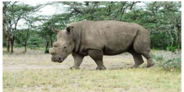
KINGDOM: Animalia PHYLUM: Chordata CLASS: Mammalia ORDER: Perissodactyla FAMILY: Rhinocerotidae GENUS: Dicerorhinus Became extinct: Approximately before 1900

The Northern Sumatran rhinoceros is the largest subspecies. It has longer hair on the ears and longer horns. They are also known as the Hairy Rhinoceros or Chittagong rhinoceros, the Sumatran Rhinoceros was the smallest rhinoceros there was, although it was still pretty large. Again, these Rhinos were killed for the same reasons; their horns sold for a large amount in the Chinese market, and their hide made for good armour. Extinct in India today, but spotted in Myanmar islands but are less than 100.