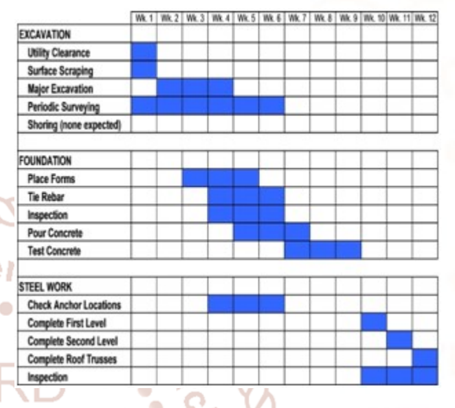
Fig: 2 Bar Chart

for representing many pieces of a project's information. A project must be broken into smaller, usually homogeneous components, each of which is called an activity or task. Bar charts basically use the x-axis to depict time, and the y-axis is used to represent individual activities.