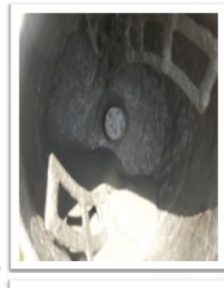
Table 3.12 Modified mortar 2 (with 10%flyash,8%silica fumes)