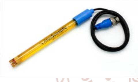
Fig. 8. Ph Sensor

Ph sensor will measures the ph level of soil. Various crops having different levels of ph value in soil. It is mostly used in nurseries and lawn care company's. Fig. 8 shows Ph sensor.