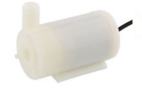
Fig. 12. Water Pump

Submersible water pump is used in our system. It is totally dipped in water tank and main drip wire is connected into this pump. Fig. 12 shows Water pump.