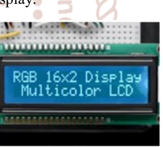
Fig. 11. LCD Display