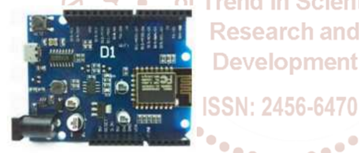
Fig. 4. Wemos D1 ESP 8266

Wemos D1 is an ESP 8266 Wi-Fi based board it's using Arduino layout and having a large flash memory. In our system it will act as a master of all other components. The connections are very easy and using simple instructions to connect system the internet (OTA). It will send and receive the data's over the internet. Fig. 4 shows Wemos D1 ESP 8266.