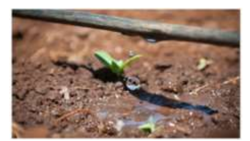
Fig. 1. Drip irrigation

In a computer era robots and heavy machines can replaces the humans. In this scenario we must develop our irrigation technologies to manage and maintain the system using IOT/ WOT and any other technologies. In many systems are developed already in irrigation in our system adding new features to easily use and maintain end users. Fig. 1 shows drip irrigation system model. Fig. 2 shows smart / automated drip irrigation system controlled via the end user devices.