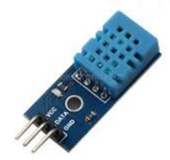
Fig. 6. Humidity Sensor