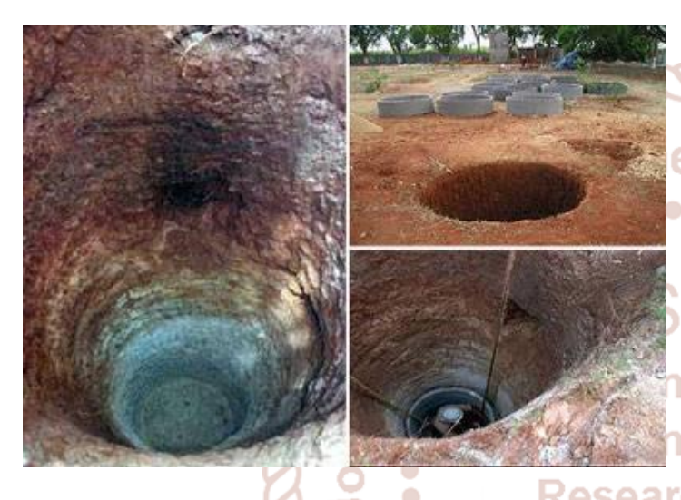
Figure.9 Recharge well

Artificial recharge wells are engineered systems where surface water is put on or in ground for infiltration and subsequent movement to aquifer to augment ton groundwater resource. Other objectives of recharge well is to reduce land subsidence. The main advantage of recharge well is that they are inexpensive relative to other methods.the general dimensions for rainfall ranging from 600 mm to 900 mm are 3 feet diameter and depth 20 feet for every 1000 sq.m. each well can recharge 2500 lit/day to 1000 lit/day depending upon rainfall.