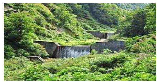
Figure.8 Check dam

(i) Earthen or cement check dams can be constructed across bigger first order or second order streams. (ii) It should be constructed in areas of gentle slopes (less than 1.72 degrees). (iii) Depth of nala should be more than 1 m. (iv) The soil downstream of the bund should not prone to water logging. (v) Vertical distance between two check dams should be more than 1 m. (vi) It can be constructed in area having mix material.