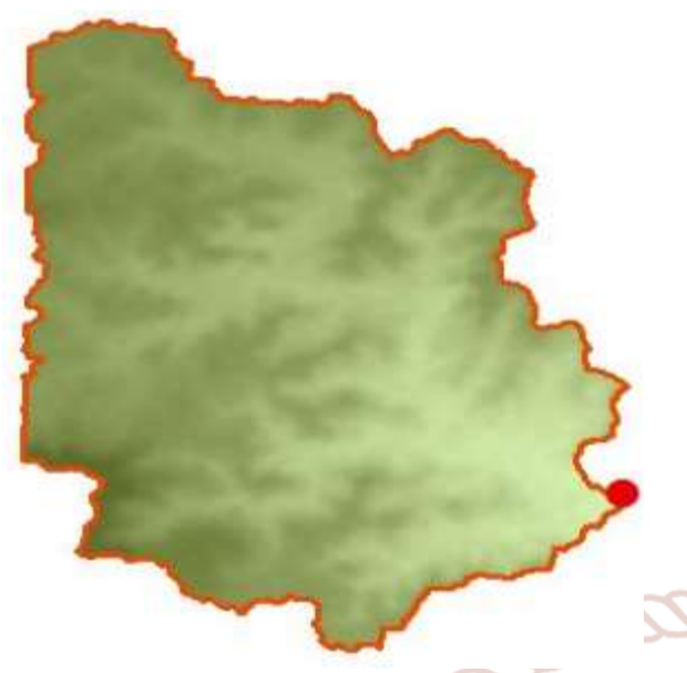
Figure.5 location of watershed outlet

International Journal of Trend in Scientific Research and Development (IJTSRD) ISSN: 2456-6470