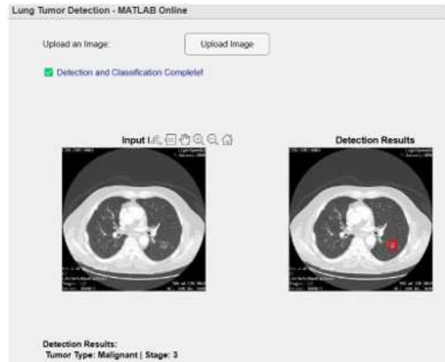
Fig. 2. Result of lung nodule detection and classification

Figure 3 presents the outcomes of a system designed for detecting and classifying lung nodules. This system integrates YOLOv5 for detection with fuzzy logic for classification. The results shown in Figure 3 detail the detection of lung nodules within CT scan images.