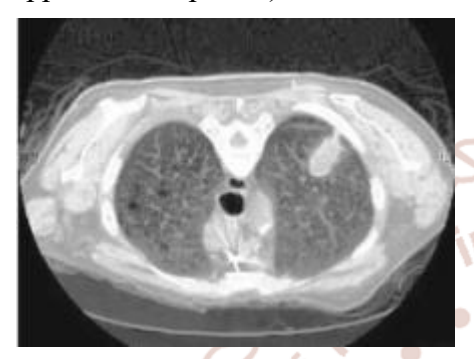
FIGURE3- GRAY SCALE IMAGE

range from [0, 1]. For uint8, values range from [0,255]. For uint16, values range from [0,65535]. For int16, values range from [-32768, 32767]. At present, the most commonly used storage method is 8-bit storage, which have 256gray level intensity of each pixel can have from 0 to 255, with 0 being black and 255 being white. (REFERENCE- "A theory based on conversion of RGB image to Gray image" by- Tarun Kumar and Karun verma, computer science and engineering department, @ International journal of computer application sep2010).