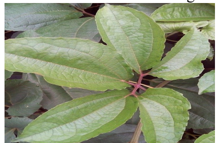
Fig. 1: TelfairiaOccidentalis (Fluted Pumpkin)

The materials used for this work were; TelfairiaOccidentalis (Fluted Pumpkin), the extracts from the leaves were used as reducing agent, and 0.01M solution silver nitrate (AgNO<sub>3</sub>.) was used as the source of silver ions. Also used was milli-Q-water. The leaves used can be seen in fig. 1 below: