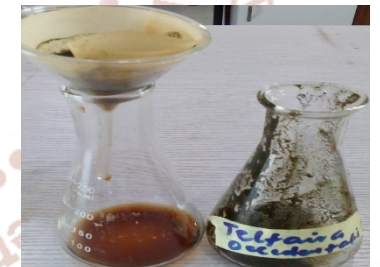
Fig. 2: Extract from Fluted Pumpkin ( TelfairiaOccidentalis ) Dried Leaves

Here the procedure varied slight from that of preparing extracts from fresh leaves. Fresh leaves of fluted pumpkin were collected from the University of Uyo, Biological Garden, the leaves were sun-dried after thoroughly washing them. They were again dried in the oven at 40°C for 24hrs. The leaves were then blended using a blender. From the dried-processed leaves, 5g was measured and transferred into 250 ml beaker to which was poured 50 ml milli -Q- water and boiled on the heating plate. The suspension was allowed to cool before it was poured into the funnel with filter paper to filter out the suspension. The extract was collected as filtrate in the beaker. See fig. 2 below: