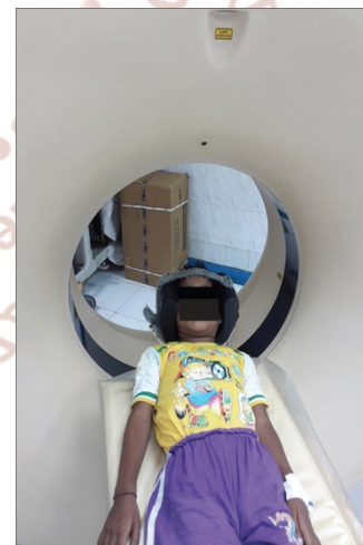
Figure 2: The head immobilizers should be used for children to avoid motion artifacts and repeat scan

Regular audits and quality checks for the equipment must be ensured for optimum performance and calibration for pediatric use.