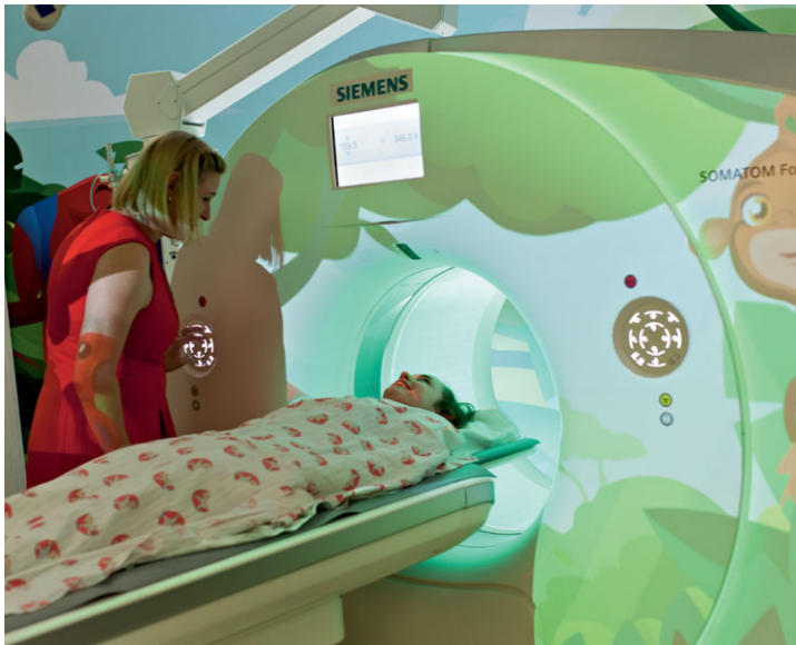
Figure 1: The investigation room and the gantry are colorful. This makes the environment friendly for the children and helps in receiving their cooperation

colorful characters, and there can be children's books or a small aquarium in the waiting room [Figure 1].