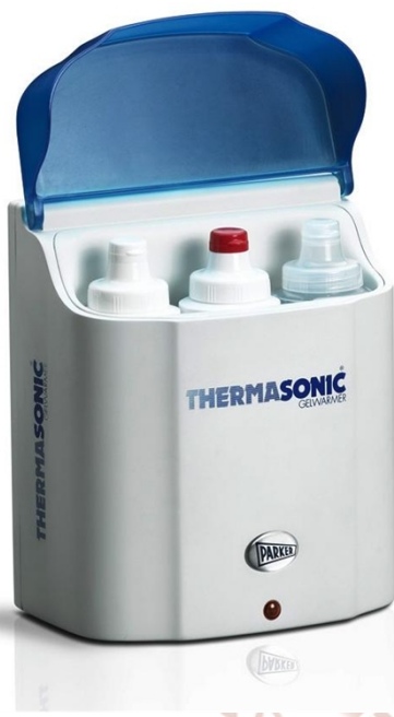
Figure 4: The gel warmers should be used in cold environment to avoid unpleasant sensation

Pediatric USG is relatively safe with no risks of radiation, cheap, and readily available. USG may be repeated over and over again for follow-up studies, without any significant risks. Special pediatric probes should be used which are usually smaller in size and have adjustable higher frequencies to cope with various depths and patient needs.