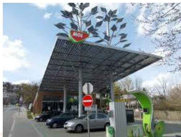
Figure 7. Greenwashing