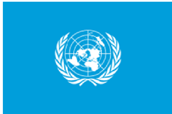
Figure 1. Green job