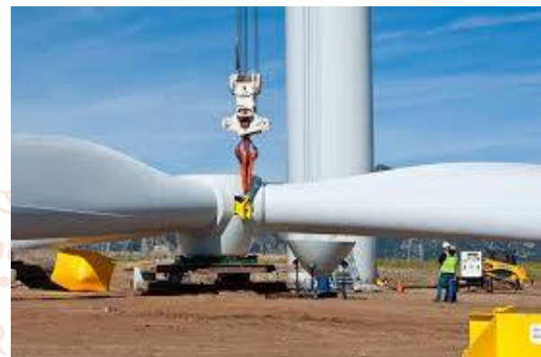
Figure 2. Green collar worker