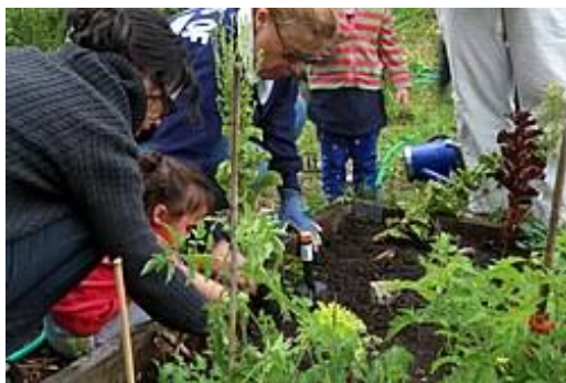
Figure 4. Sustainable agriculture