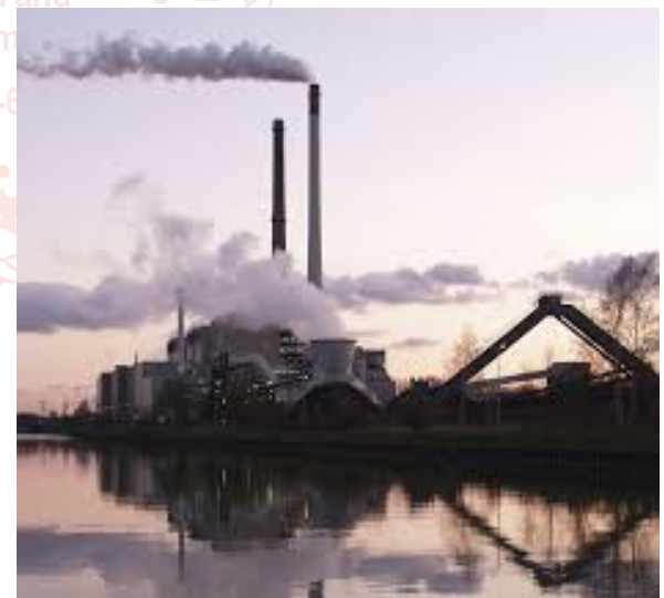
Figure 3. Emissions trading