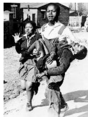
Figure 4. Soweto uprising

https://en.wikipedia.org/wiki/Sharpeville_massacre