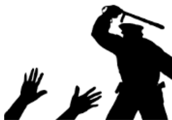
Figure 1. Police brutality