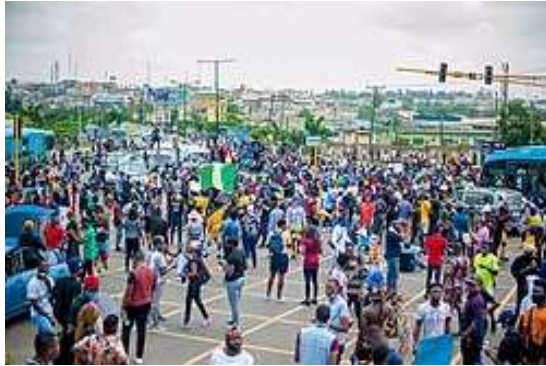
Figure 6. End SARS

https://en.wikipedia.org/wiki/Black_Lives_Matter