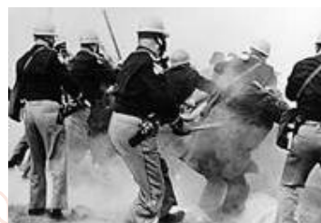
Figure 2. Police brutality in the United States

https://en.wikipedia.org/wiki/Police_brutality