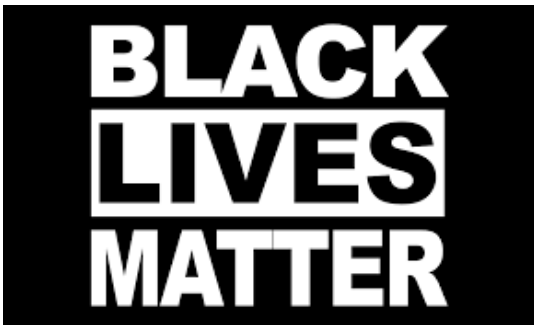
Figure 5. Black Lives Matter