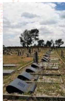
Figure 3. Sharpeville massacre

https://en.wikipedia.org/wiki/Police_brutality_in_the_United_States