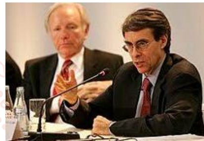
Figure 8. Human Rights Watch

https://en.wikipedia.org/wiki/Lists_of_killings_by_law_enforcement_officers_in_the_United_States