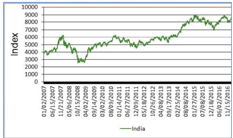
Fig.2: Nifty 50 closing data