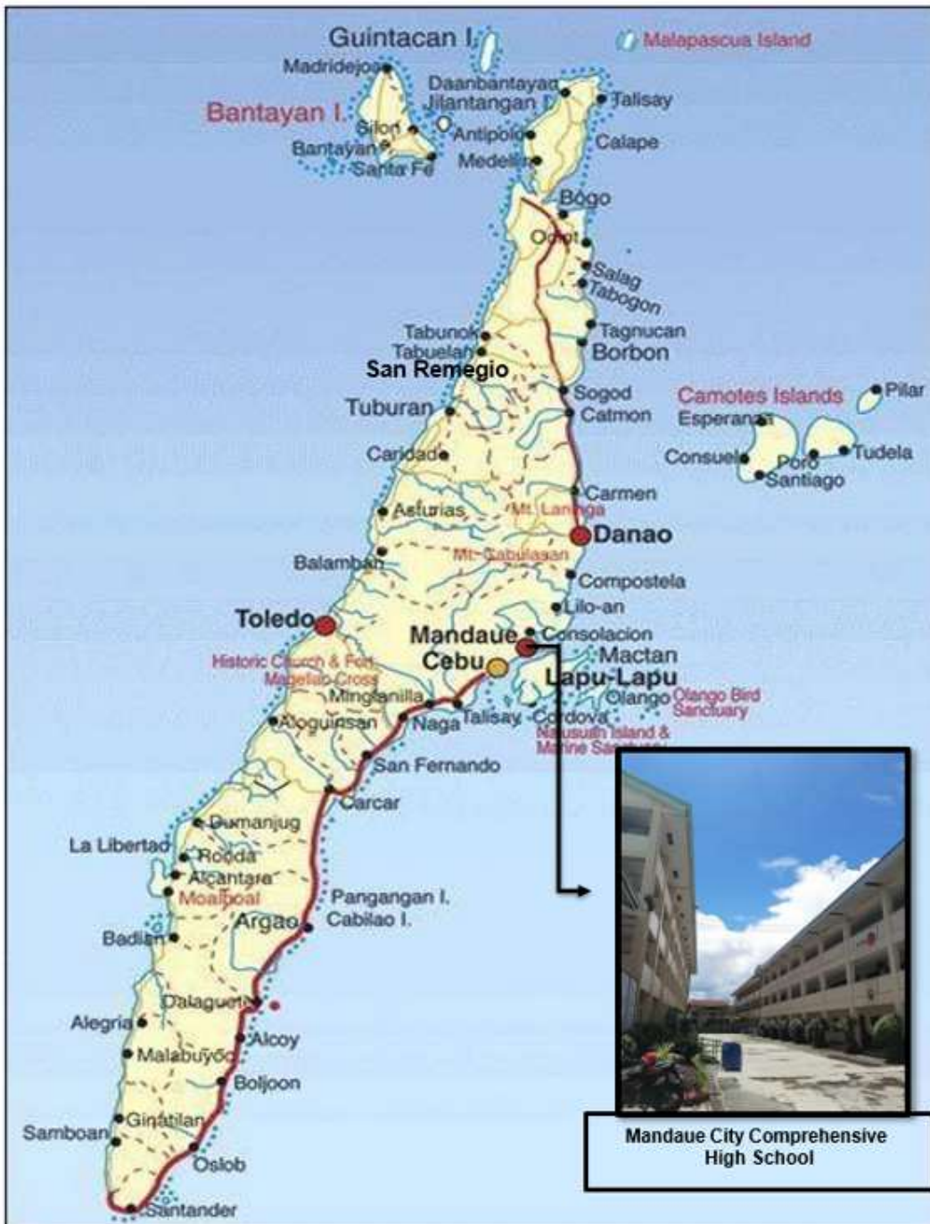
Figure 3: Location of the Research Environment

Part I. The instrument's first part, which included a chosen short narrative and a structured quiz to assess beginning literacy levels, functioned as the baseline pre-test.