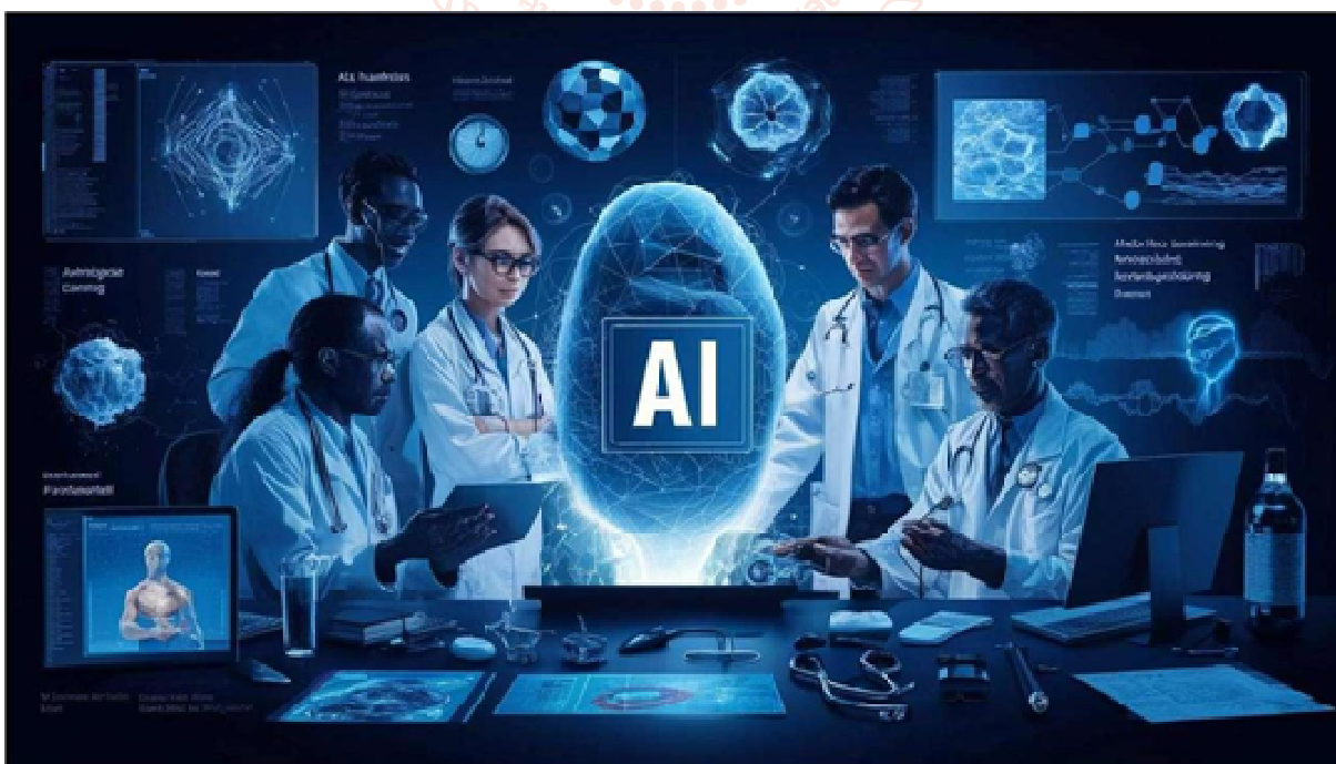
Fig.1 Artificial Intelligence in Healthcare

Digital technology breakthroughs are causing a rapid shift in the healthcare sector, with artificial intelligence (AI) at the forefront of this change. Artificial intellect (AI) describes computer-based systems that can carry out activities like pattern recognition, experience-based learning, and decision-making that typically need human intellect. AI is being incorporated into clinical and administrative procedures in the healthcare industry to improve patient care's precision, effectiveness, and quality. AI now has the chance to assist medical personnel by offering data-driven insights because to the growing amount of large-scale medical data that is available from wearable technology, diagnostic imaging, electronic health records, and laboratory systems. Additionally, AI is advancing pharmaceutical research, telemedicine, and personalised care. Faster medication development procedures, early health problem identification, and remote patient monitoring are all made possible by intelligent systems. AI has many advantages, but putting it into practice requires addressing issues like data security, moral dilemmas, and legal compliance.