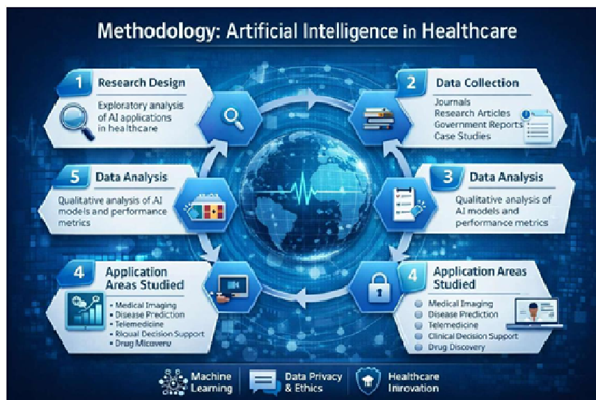
Fig.2 Proposed Research Methodology for AI in Healthcare Study.

evolve toward digital transformation, AI is expected to play a central role in improving healthcare quality, operational efficiency, and global health outcomes [22].