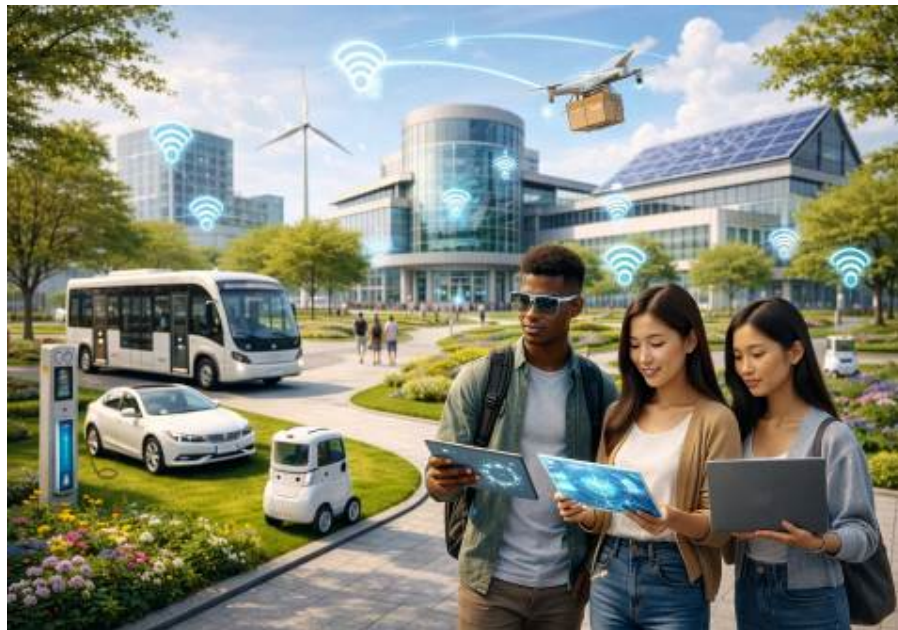
Fig 2. Implementation of a Smart Campus Management System Using AI and IoT

Cloud-based data storage and management is the process of storing data in remote servers that can be accessed via the